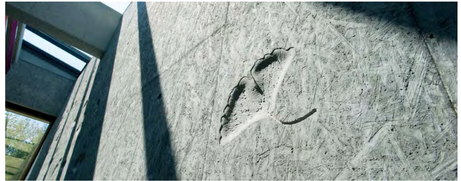
↑ Skylights in the auditorium ↓ Auditorium