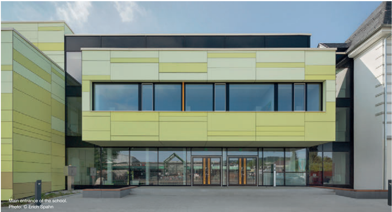
Main entrance of the school.

Energy efficient sanitation of the Jean-Paul School, built in around 1920, with gym and swimming bath, both built in the 1960 and 1970 years.