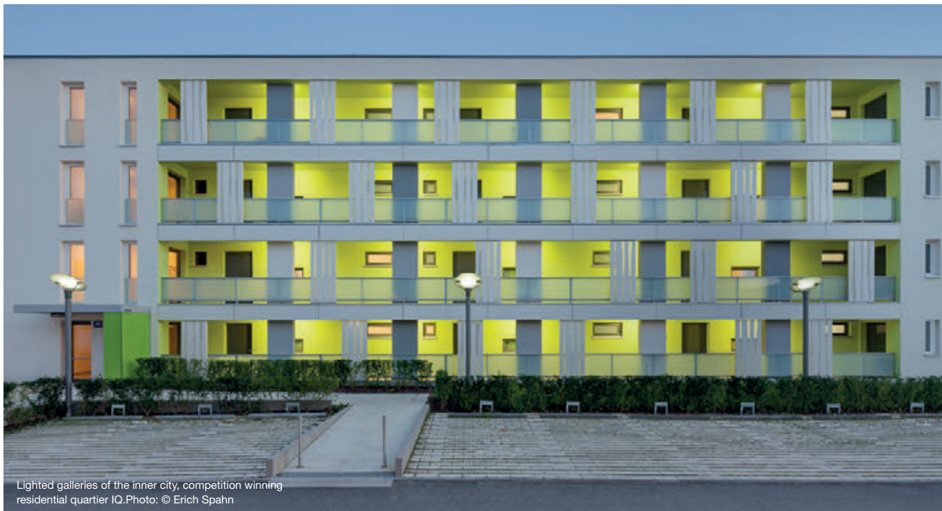
Lighted galleries of the inner city, competition winning residential quartier IQ.

employees fulfil a performance spectrum ranging from architecture and urban planning to general planning and competitions.