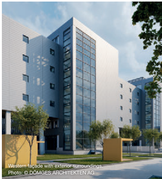
Western façade with exterior surroundings.