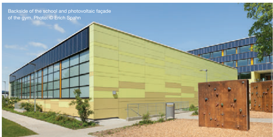
Backside of the school and photovoltaic façade of the gym.