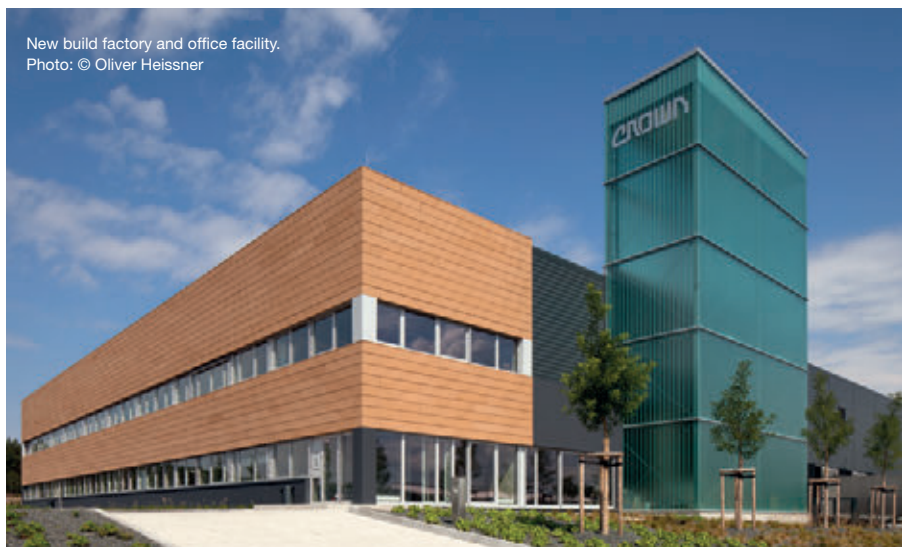
New build factory and office facility.