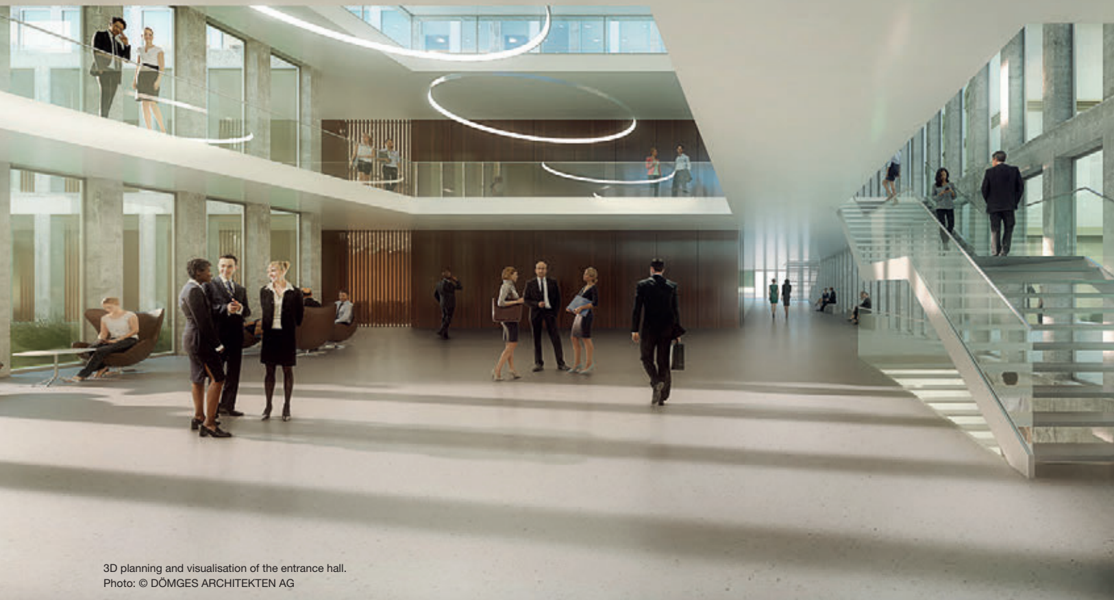
3D planning and visualisation of the entrance hall.